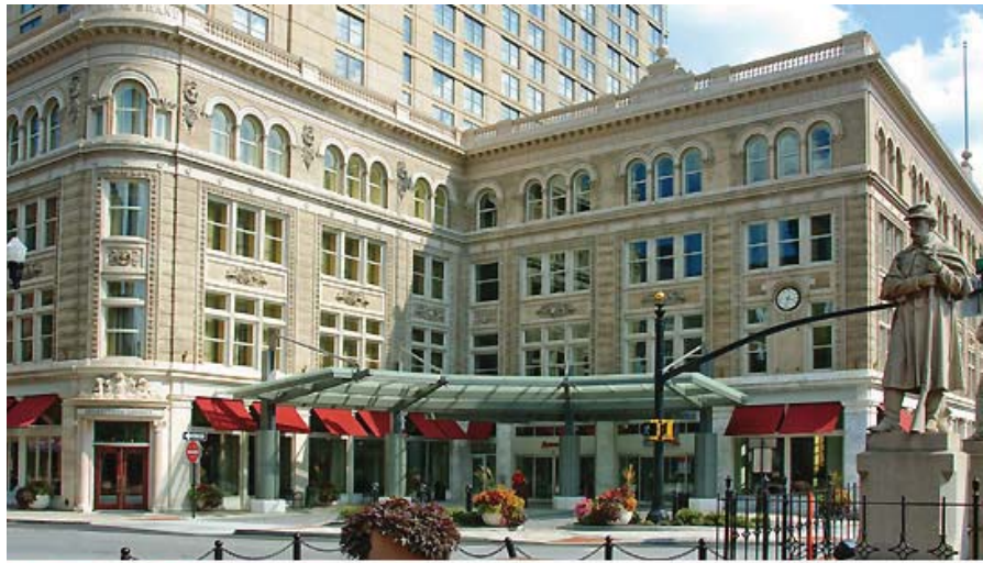
Join us for Jazz Fest at the beautiful Marriott Lancaster at Penn Square

In addition to the festivities, this year's Jazz Fest will celebrate YOU! You have made this event into an experience. You have made the event into what it is today...come make merry, enjoy the company of friends old and new and take pleasure in enjoying food, fun and music; all in support of the good works of Clare House. Mark your calendar... Friday August 6th! See you there!